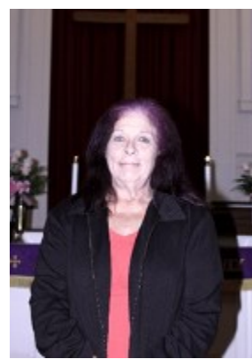
B. Cricket Linn