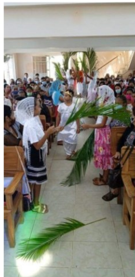
Children on Palm Sunday