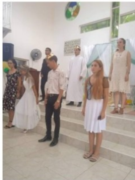
Church's Youth at Easter Service