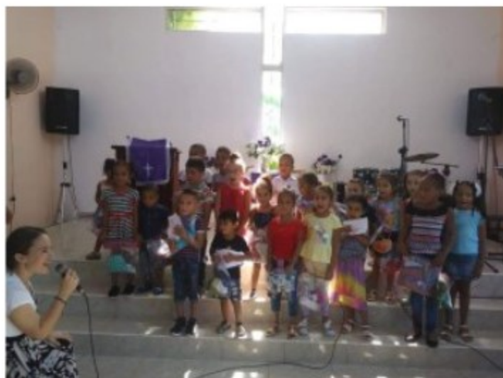
Children Singing Praises